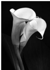
With photography, tenderness and passion can last forever.

Classes are kept small to ensure that everyone has the chance to enjoy the class.